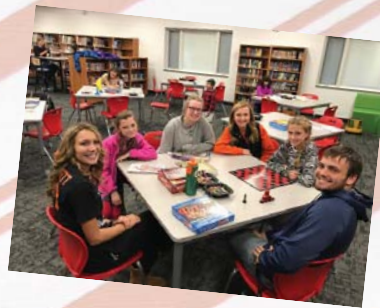
Thanks to the Lucas Honors Society for helping the Lucas PTO with child care during parent teacher conferences.