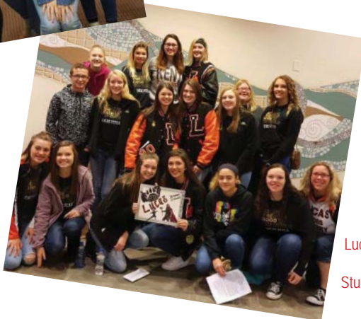
Lucas FCCLA students attended the annual District Leadership Conference on Nov 7th. Students walked away equipped to be better leaders for their peers and community!