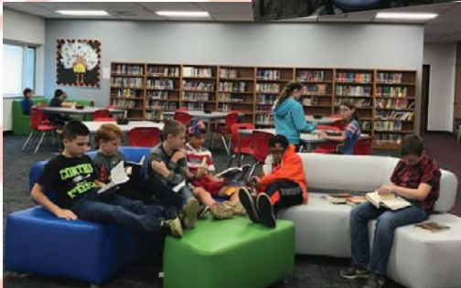
5th grade students enjoying the newly renovated library!