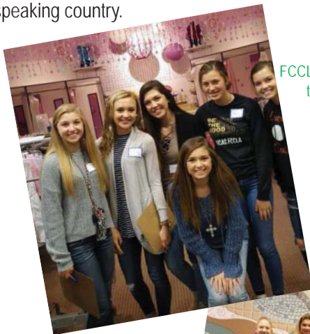
FCCLA students volunteer their time at the New store!

We wish to thank the Lucas Sustaining Funds committee for their financial support for this endeavor.