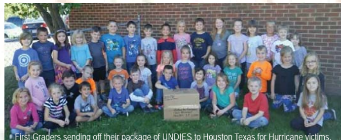
First Graders sending off their package of UNDIES to Houston Texas for Hurricane victims.